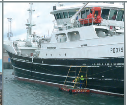
Photo 1: Hot metal zinc sprayed. Photo 2: Clean and sanding down. Photo 3: Hull Painting.

The vessel was fully cleaned down and all surfaces were sanded down and prepared for painting. After preparation works, the ship was fully painted from the top of the mast to the keel using over 1500 litres of paint and over 2000 working man hours. Due to the preparation works involved the vessel will now be able to work for many years before full painting is required again.